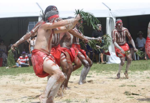
Dances at Yabun