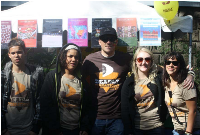
Quick group photo! The t-shirts were hotly sought after and very funky.