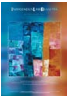
Volume 7(19) July/August out now