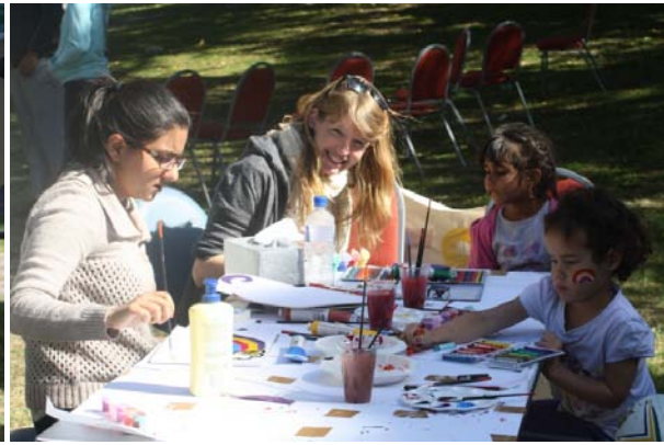
Giving some budding young artists a helping hand