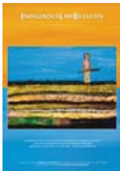
Latest issue Volume 7(22) Jan/Feb 2011