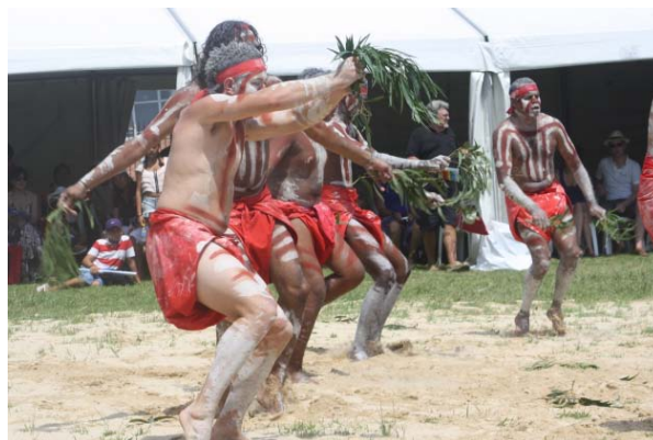
Dances at Yabun